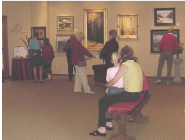
Patrons enjoy newly expanded lobby at Center/Stage during Evergreen Chorale's run of "Music Man." The lobby includes Evergreen's newest gallery space.